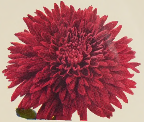
ROYAL ROBE. 75c each; 3 for $2.00